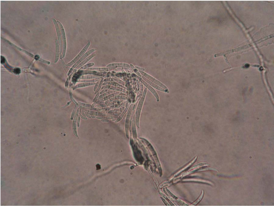
Figure 2 Spores of the fungus Fusarium