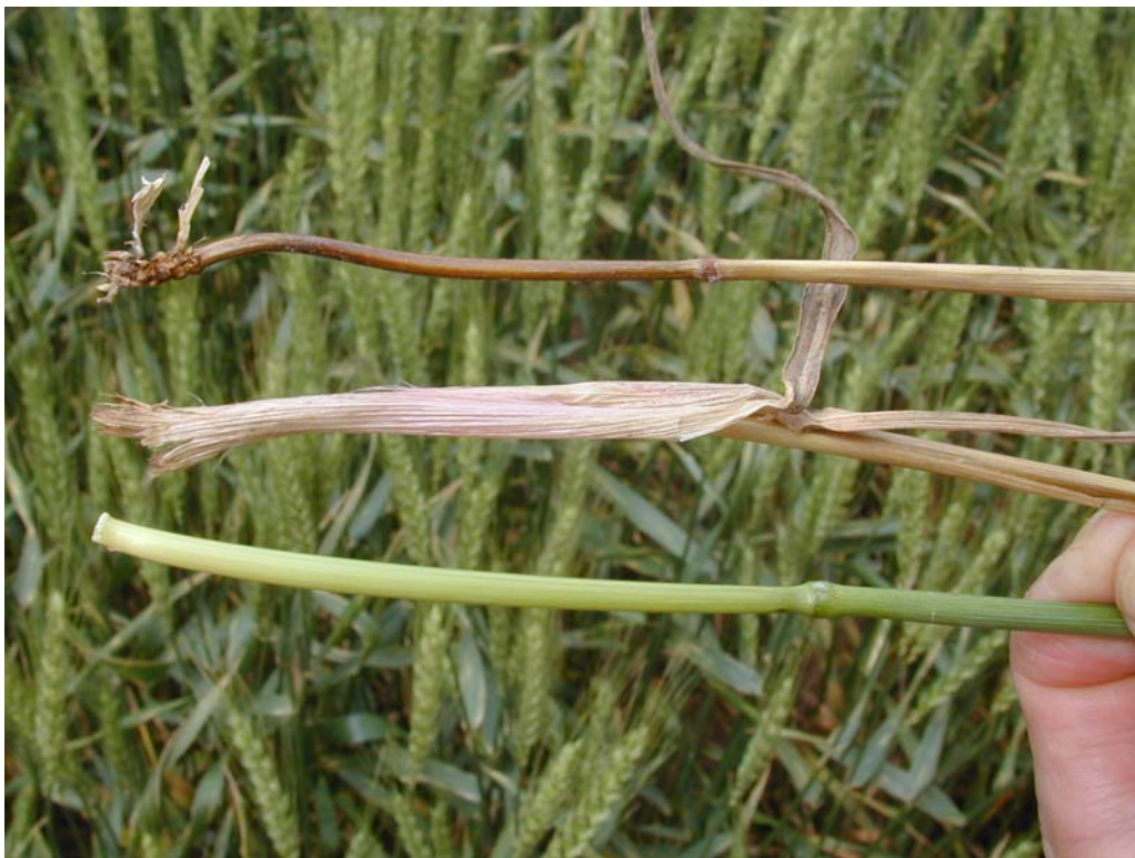
Figure 6 Wheat tillers infected with Fusarium and showing symptoms of Fusarium (dryland) root rot (not healthy stem on bottom).