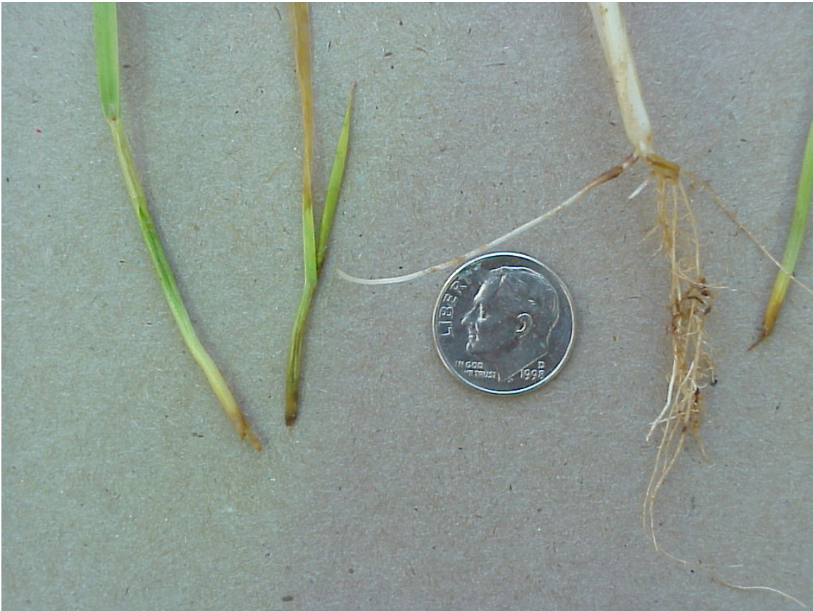
Figure 5 Wheat seedlings in the fall with rotted roots due to Fusarium (note healthy seedling on right).