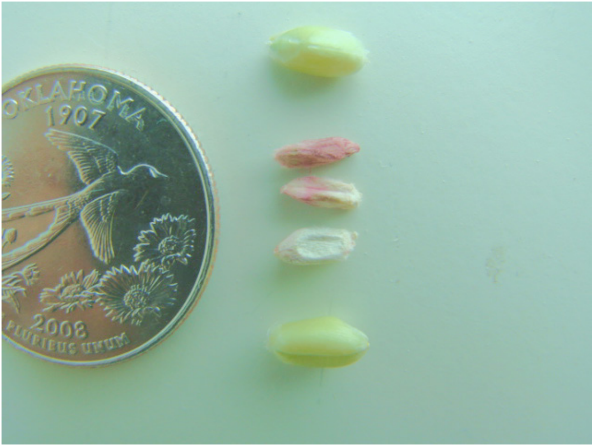
Figure 4 Wheat seed infected with Fusarium (healthy seed on top and bottom; note reddish color often indicative of presence of Fusarium).