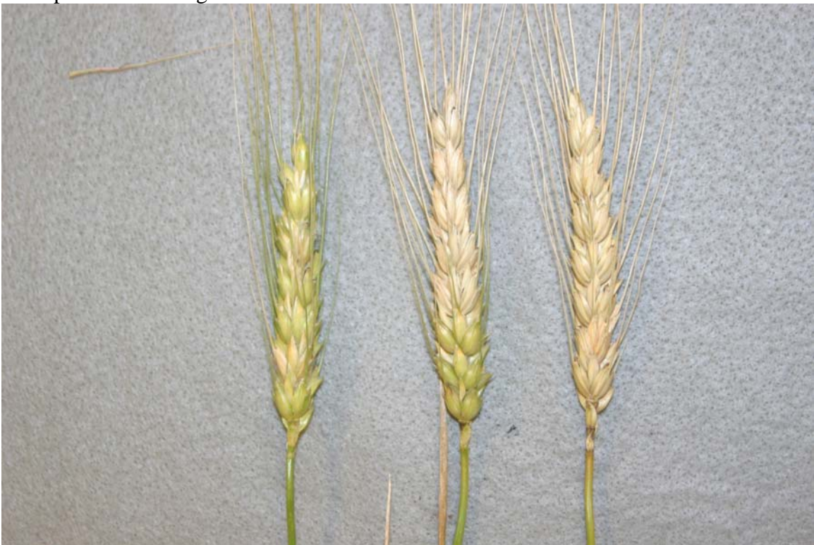
Figure 3 Wheat heads infected with Fusarium (head on left is partially infected; head on right is totally infected).